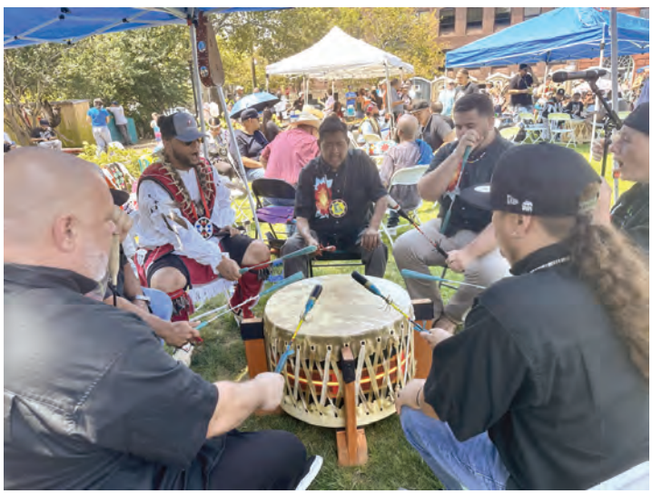
Musicians perform traditional drum cadences at the Running Strong for American Indian Youth Powwow Aug. 6 at Waterfront Park.