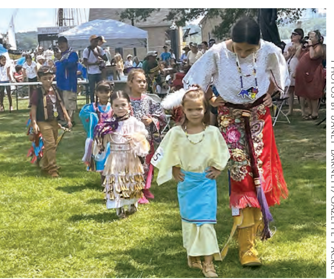
Children prepare for the Running Strong for American Indian Youth Powwow Tiny Tots competition Aug. 6 at Waterfront Park.