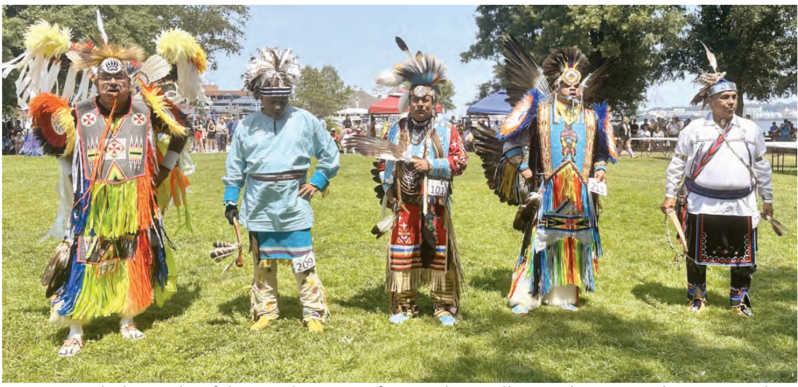
Dancers await the results of the Running Strong for American Indian Youth Powwow dance competition Aug. 6 at Waterfront Park.